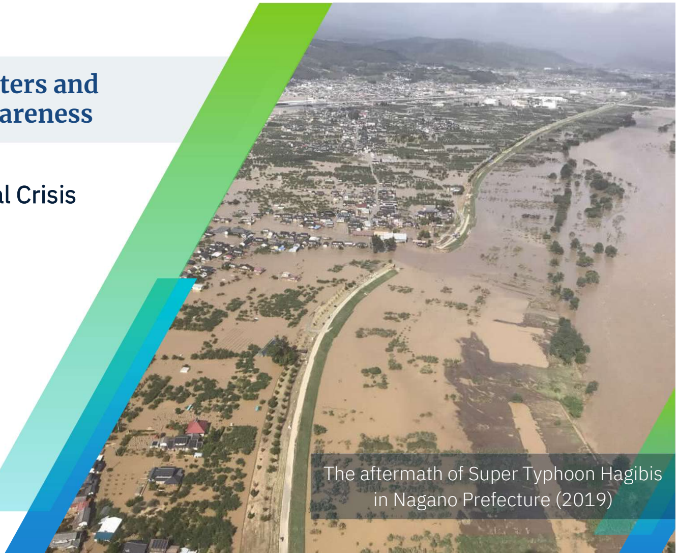
The aftermath of Super Typhoon Hagibis in Nagano Prefecture (2019)