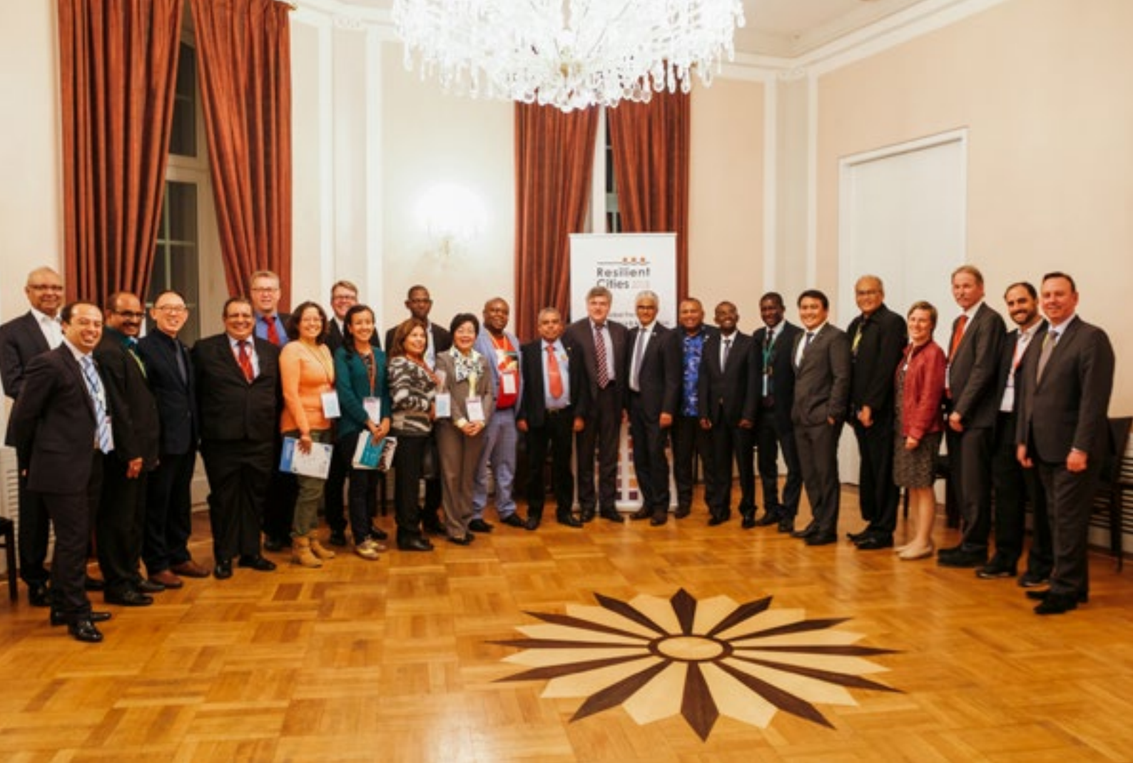
Cities and Regions Talanoa Dialogue at Resilient Cities 2018 in Bonn, Germany