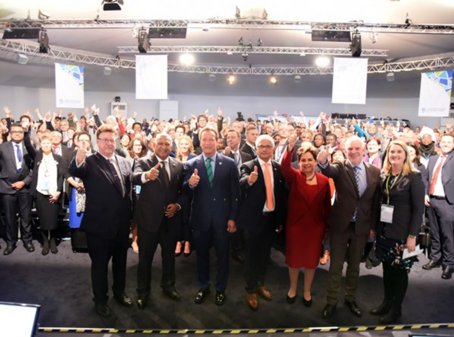
Leaders at the closing plenary of the COP23 leaders summit

In short, the Cities and Regions Talanoa Dialogues open channels for sharing resources, knowledge and responsibility across governments at all levels.