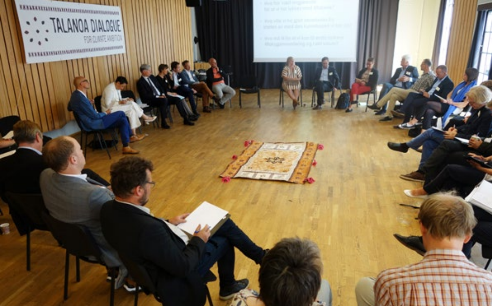
Participants at a Cities and Regions Talanoa Dialogue event in Norway