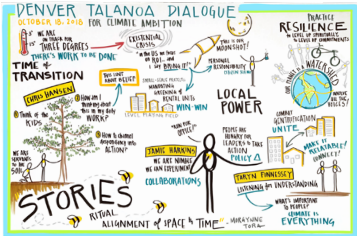
Planning excerpt of Cities and Regions Talanoa Dialogue in Denver, USA