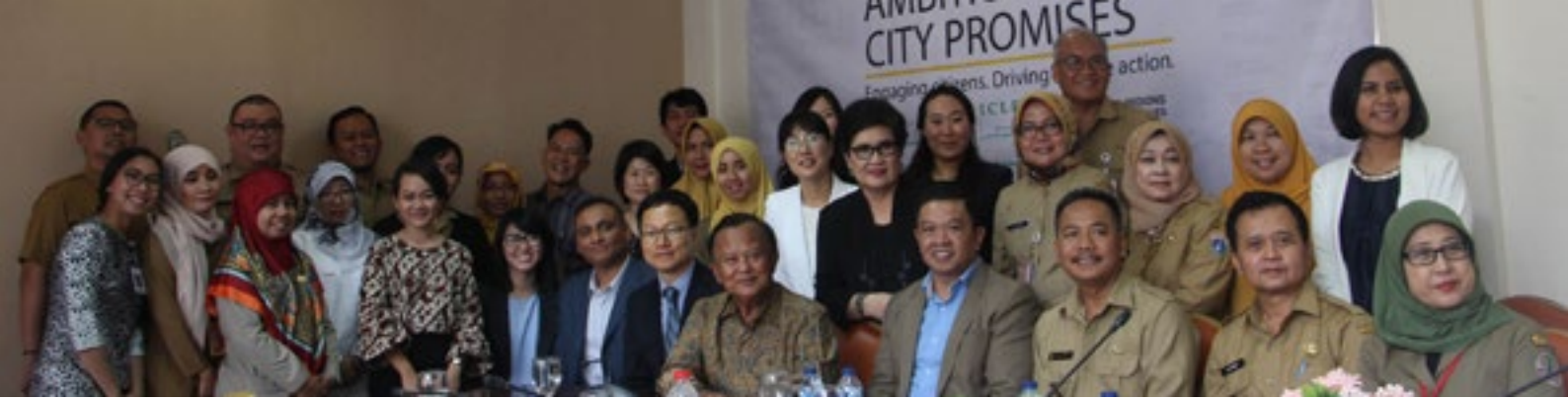
Participants at the Indonesia Talanoa Dialogue in Jakarta