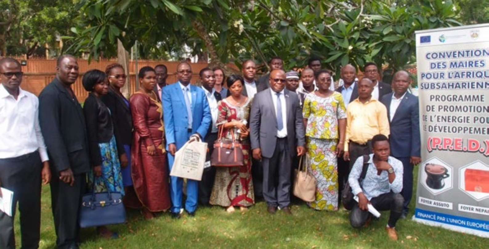
Participants at the Lomé Talanoa Dialogue in Togo