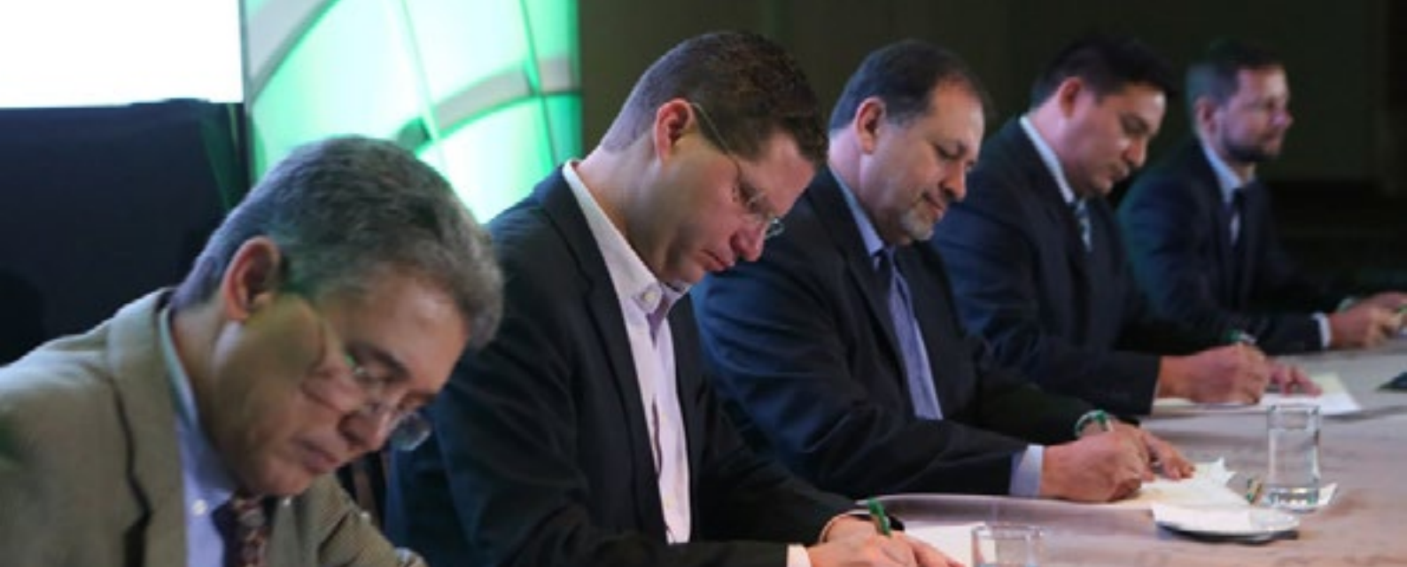
MoU signing ceremony in Quito, Ecuador