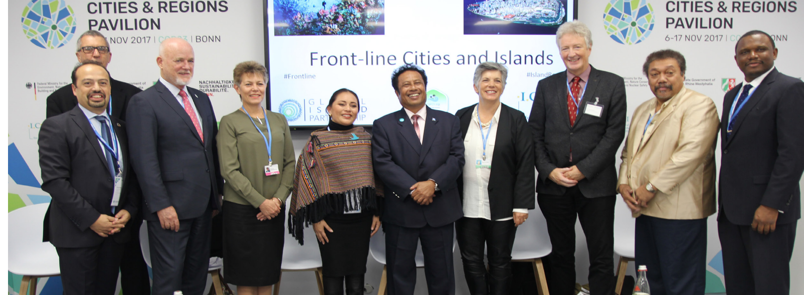
Launch of the Front-line Cities and Islands initiative at the Cities and Regions Pavilion.