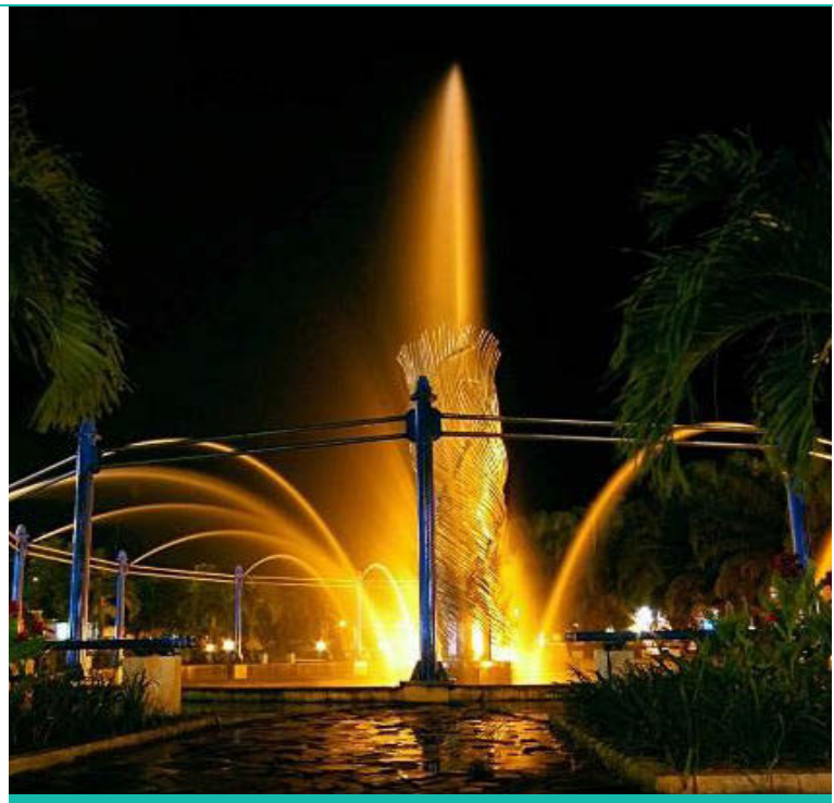
1. Iconic City Symbol of Balikpapan.