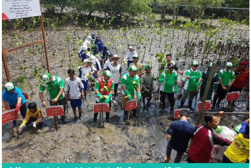
2. Mangrove planting activity led by the City Government of Balikpapan.

From 2013 to 2016, Balikpapan participated in the Urban-LEDS I project as a model city to conduct a greenhouse gas (GHG) emissions inventory and developing a GHG Emission Reduction Plan (RAD-GRK). The city pledged to reduce GHG emissions by almost 20% by 2020 from 2010 levels. In Urban-LEDS Phase II, Balikpapan will focus on promoting vertical integration and strengthening the Measuring, Reporting, Verifying (MRV) processes of its climate action plan.