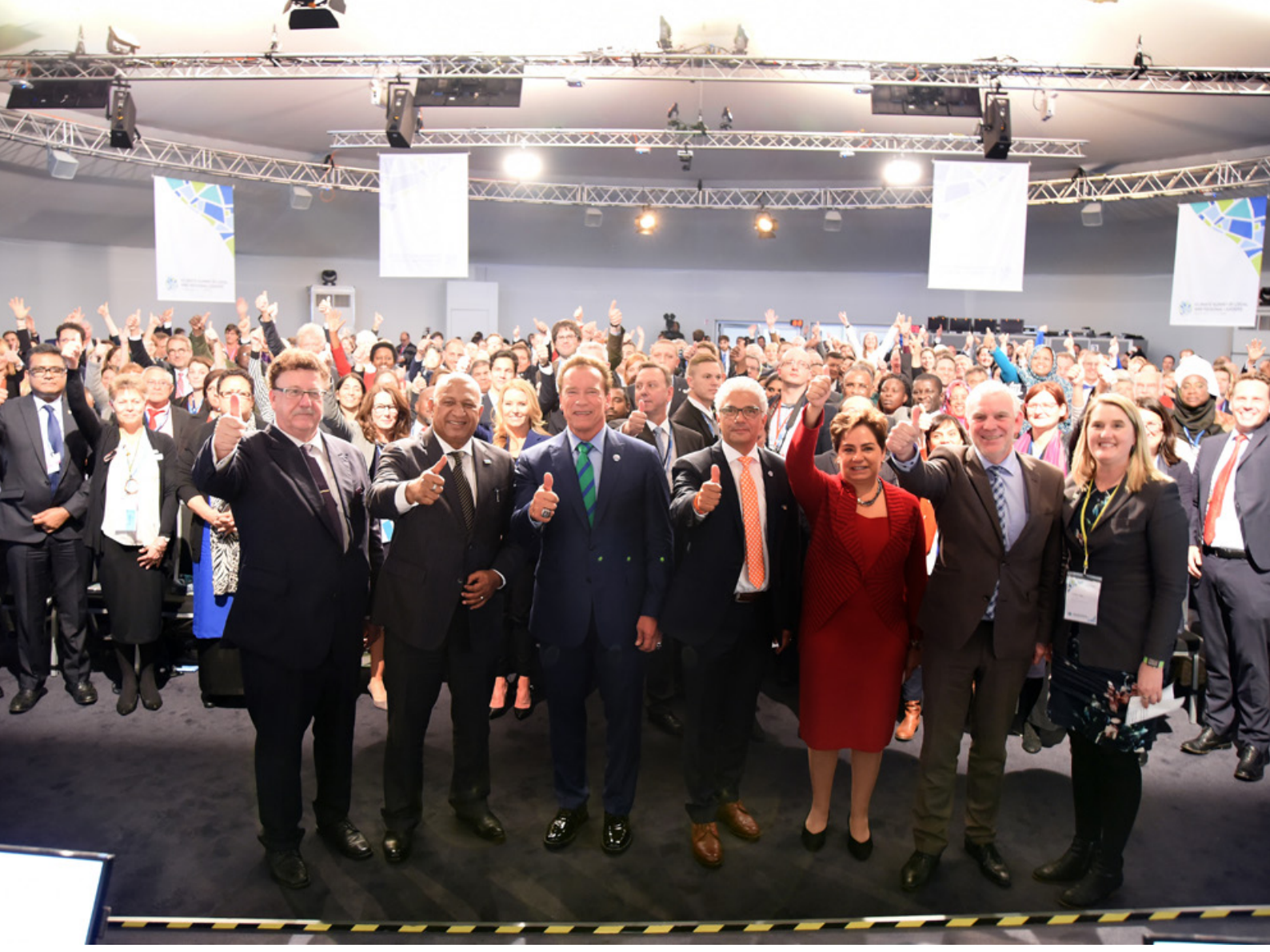
Leaders at the closing plenary of the COP23 leaders summit

In short, the Cities and Regions Talanoa Dialogues open channels for sharing resources, knowledge and responsibility across governments at all levels.