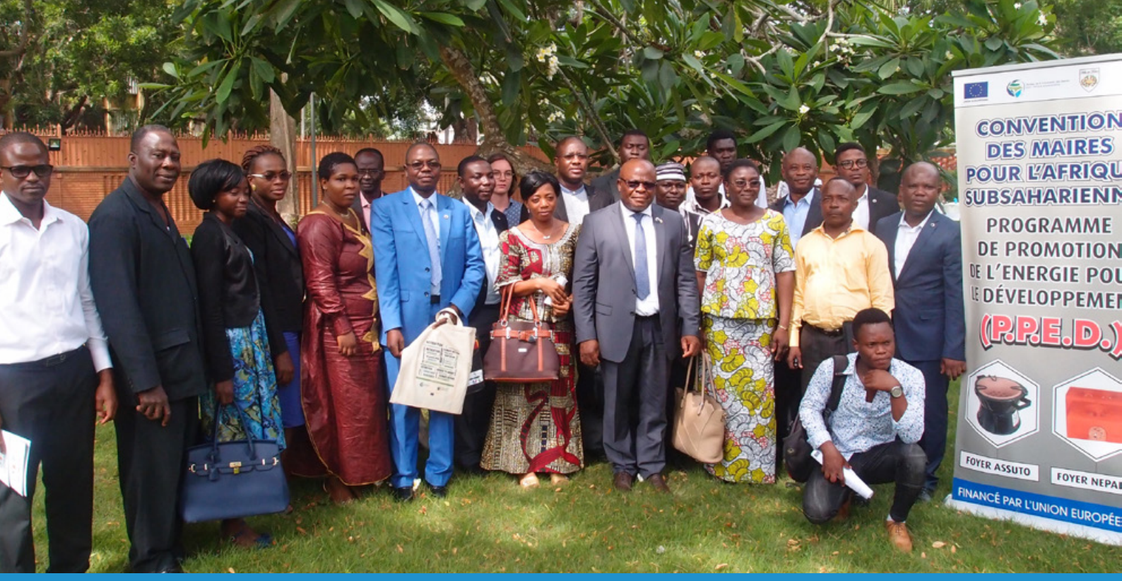
Participants at the Lomé Talanoa Dialogue in Togo