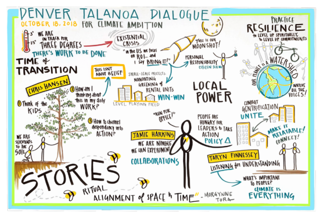
Planning excerpt of Cities and Regions Talanoa Dialogue in Denver, USA

A selection of outcomes of the Cities and Regions Talanoa Dialogues