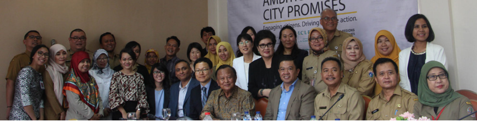
Participants at the Indonesia Talanoa Dialogue in Jakarta

CITIES AND REGIONS ENGAGED IN A TOTAL OF 60 TALANOA EVENTS IN 40 COUNTRIES