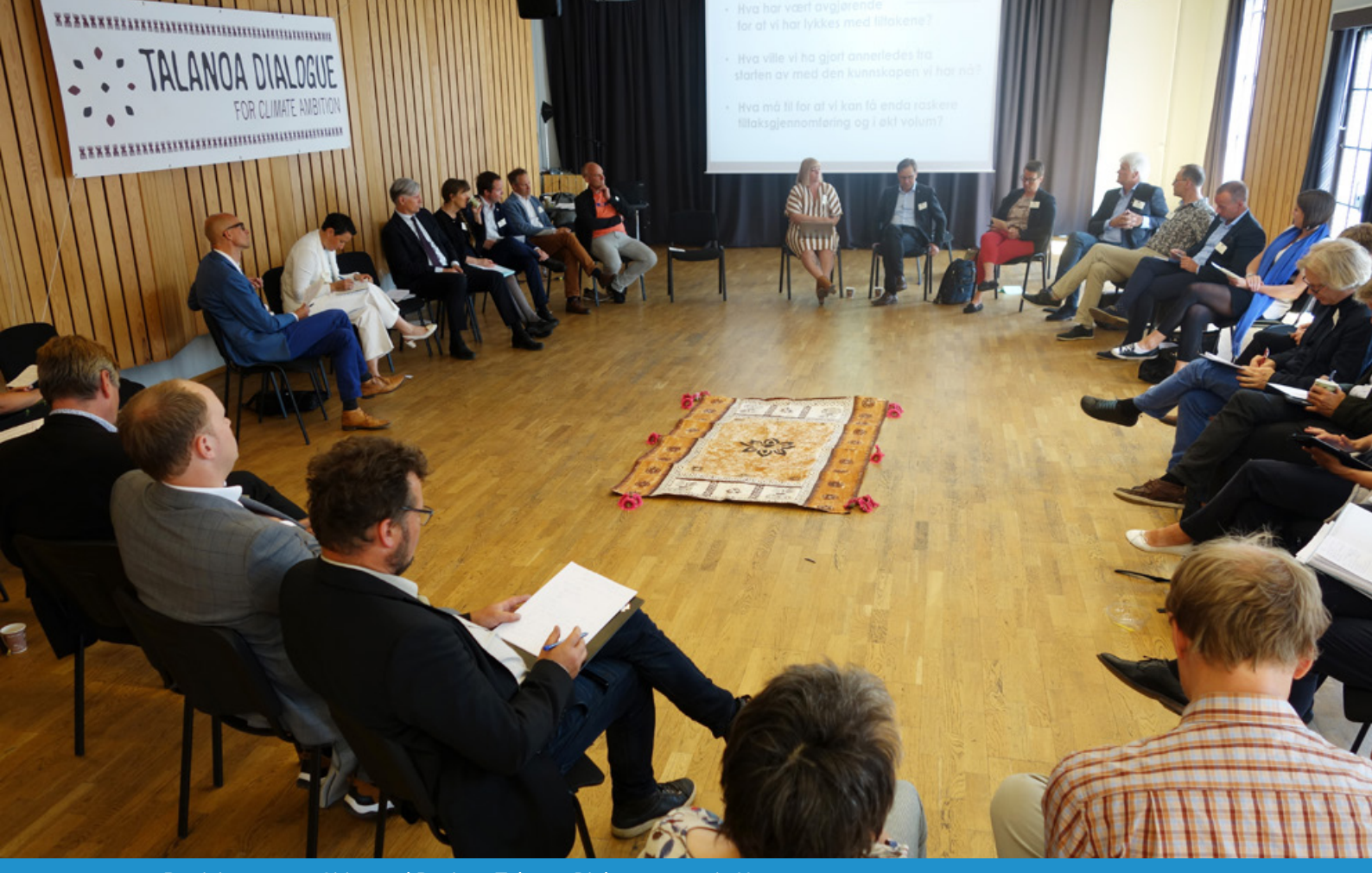
Participants at a Cities and Regions Talanoa Dialogue event in Norway