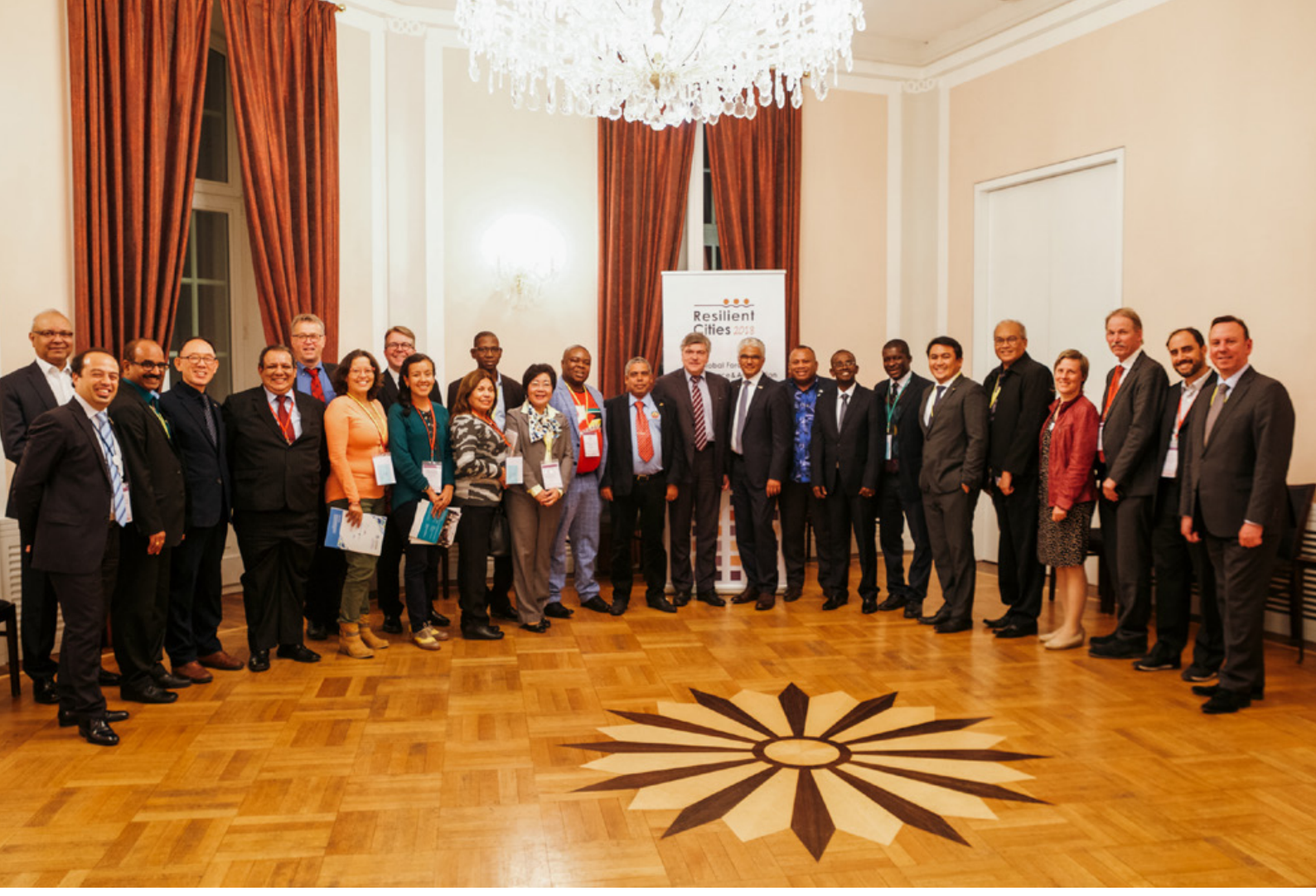
Cities and Regions Talanoa Dialogue at Resilient Cities 2018 in Bonn, Germany