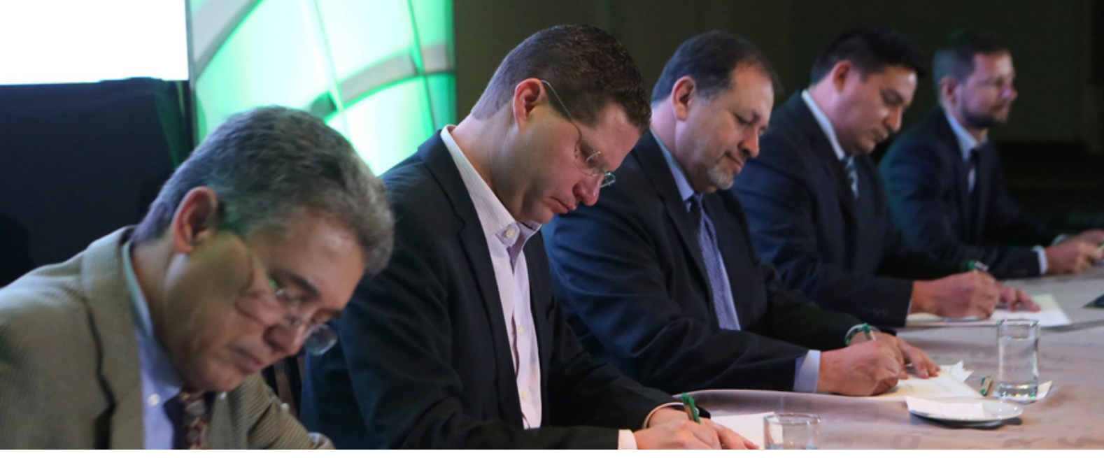
MoU signing ceremony in Quito, Ecuador